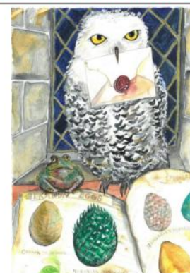
Class 6 – Spring into Sorcery Harry Potter, maps and Hinduism