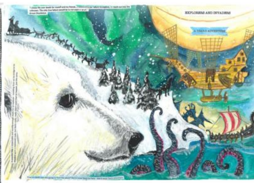
Class 5 – Explorers and Invaders Shackleton, Vikings and dragons