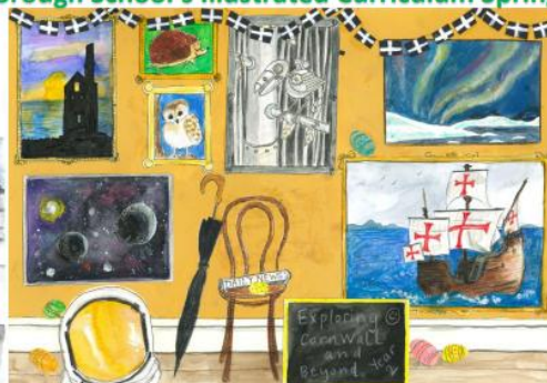
Class 2 – Exploring Cornwall and Beyond! Maps, mines and pasties