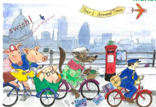
Class 1 – Around Town Places, seasons and transport