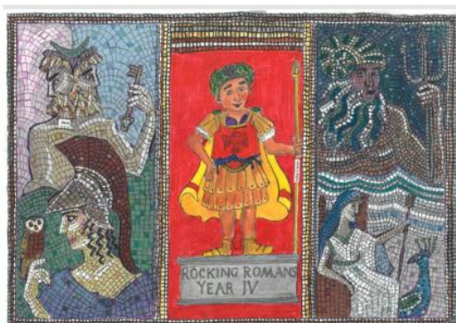
Class 4 – Rocking Romans Ancient times, myths and invasions