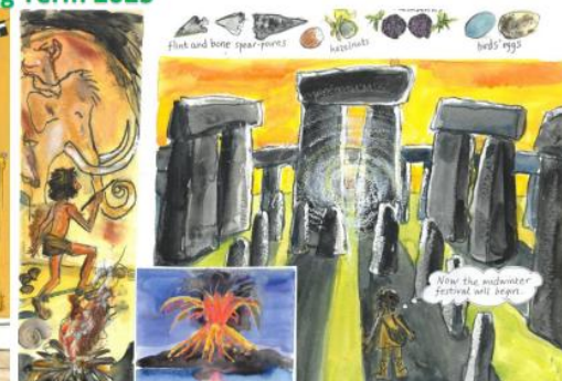
Class 3 – The Street Beneath Our Feet The stone age, rocks and geology